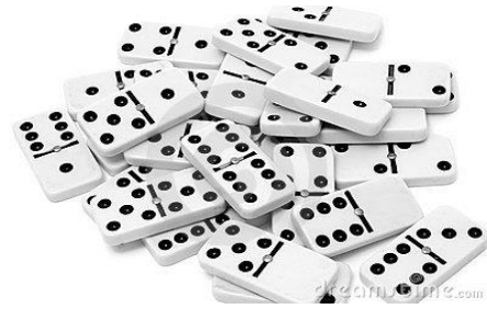
Every Monday at 1:00pm in the Craft room.