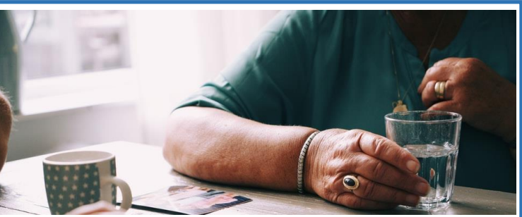
THE OLD-TIMERS' RIGHT

A group of Sun City Senior citizens was sitting around talking about their ailments: