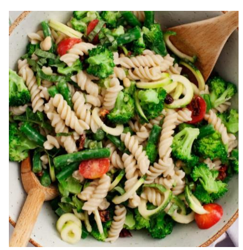
Thank you <u>Love and Lemons</u> for the recipe!