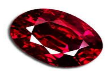
Gem = Ruby