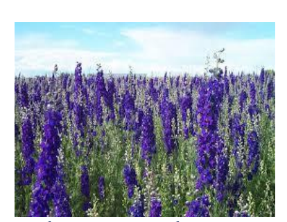
Flower = Larkspur