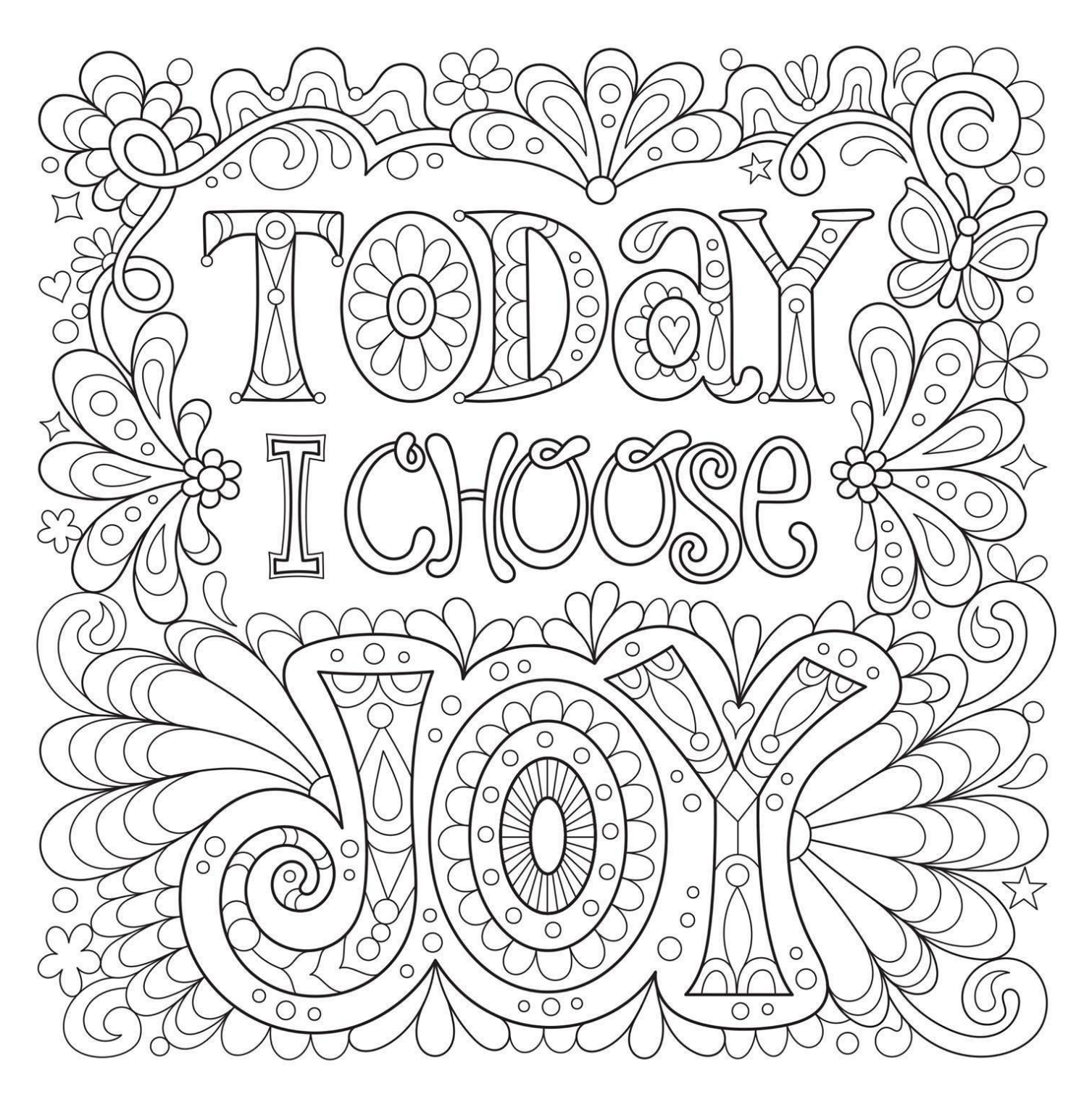
@ Than eeya \ McArdle, \ www.than eeya.com. \ From \ More \ Good \ Vibes \ Coloring \ Book \\ @ Design \ Originals, \ www.D-Originals.com. \\