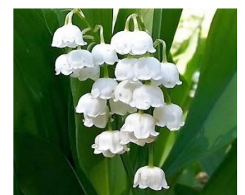
Flower = Lily of the Valley