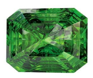
Gem = Emerald