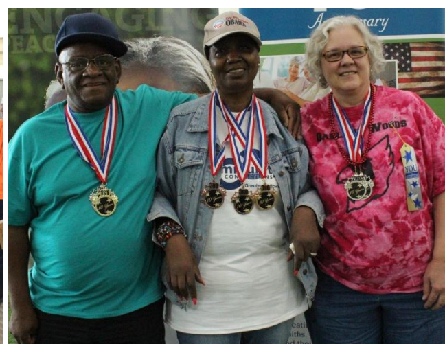
"Vee Eye See Tee Oh Are Why"*

is that your Village's battle cry? If you're having a challenge deciphering the battle cry, try reading it again but this time read it out loud. So, is it your Village's battle cry? Is your Village ready for this year's Village Victory Cup?