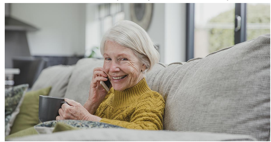
April is National Humor Month

Welcome to the month of April at Lynn Street Manor Apartments.