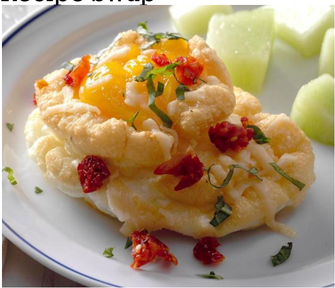
ITALIAN CLOUD EGGS Thank you <u>www.tasteofhome.com</u> for the recipe!