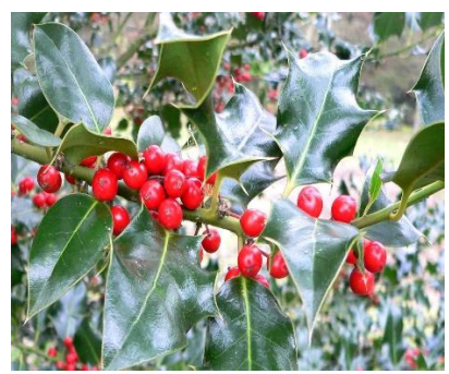
Flower = Holly