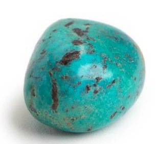
Gem = Turquoise