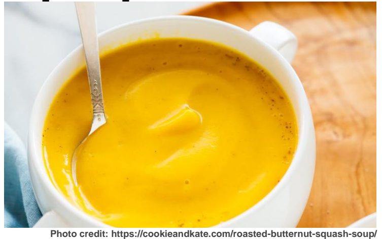
Butternut Squash Soup -Thank you Tierra