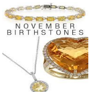
Topaz & Citrine