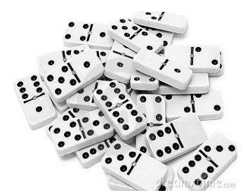
Every Monday at 1:00pm in the Craft room.