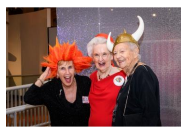
This is what Thriving looks like!

Almost 20% of the state's population is 65 or older. Michigan has moved from the 30 <sup>th</sup> oldest state in the USA to the 10 <sup>th</sup> oldest.