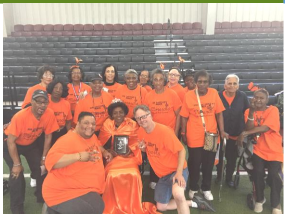
2016 PVM Village Victory Cup Spirit Award Winners (THREEPEAT!!!)