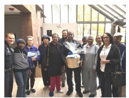
OSM Deliver Gift Baskets to the City of Westland Fire and Police Dept.