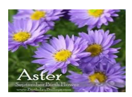
Flower=Aster (Morning Glory)