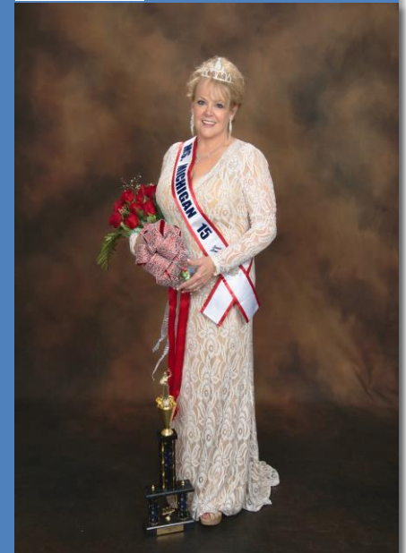
My Gown with banner, crown and trophy! Felt like a Princess!