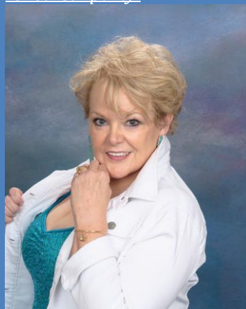
My costume for “I feel Lucky”

I will now have a “Queen’s Tea” and I want to have it at Spring Meadows. Former Queens, the pageant director, the Michigan pageant Board members are all invited. Plus Spring Meadows Board Members, and some people from PVM corporate. I am planning it for September 18. I can’t invite everyone from Spring Meadows to the tea but I will have a sing up list and we will draw out names from the list (at random) and invite residents to