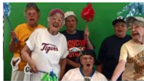
The Spring Chickens!

And while the Villages in SE Michigan were battling for the Village Victory Cup, Villages located 100 or more miles from the PVM Home office battled for the Virtual Village Victory Cup. This year a record 66 residents from 7 Villages participated in the 5th annual rendition of this event. When the final scores were tallied the Bizzv-B's from the Village of Spring Meadows II emerged victorious. The Spring Chickens from the Village of Spring Meadows I captured the Spirit Award.