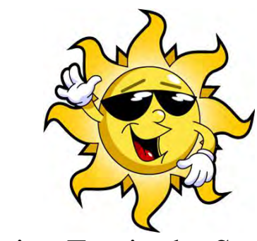
Having Fun in the Summer!

Enjoy the sunshine and the hot summer days! Summer time is about being with family, taking longer walks in the cool of the evening. Now that our days are longer and nights are a bit shorter, remember while you're out in the sun to think about your skin. Wear your sun glasses and don't forget to put on your sun screen lotion and don't forget to drink your water. Protecting ourselves and our families from the danger of too much sun exposure is essential in guaranteeing a happy healthier summer.