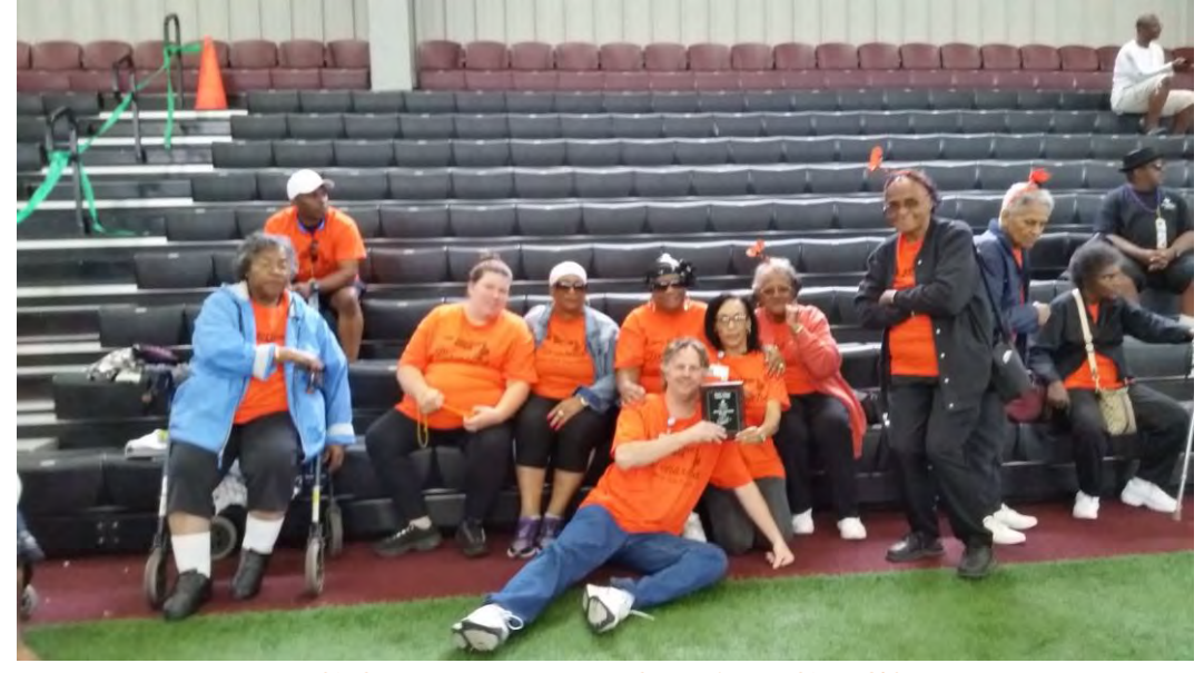
GO Manor MONARCHS!