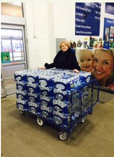
Our Water donation!

It was a great day full of fun and calories!